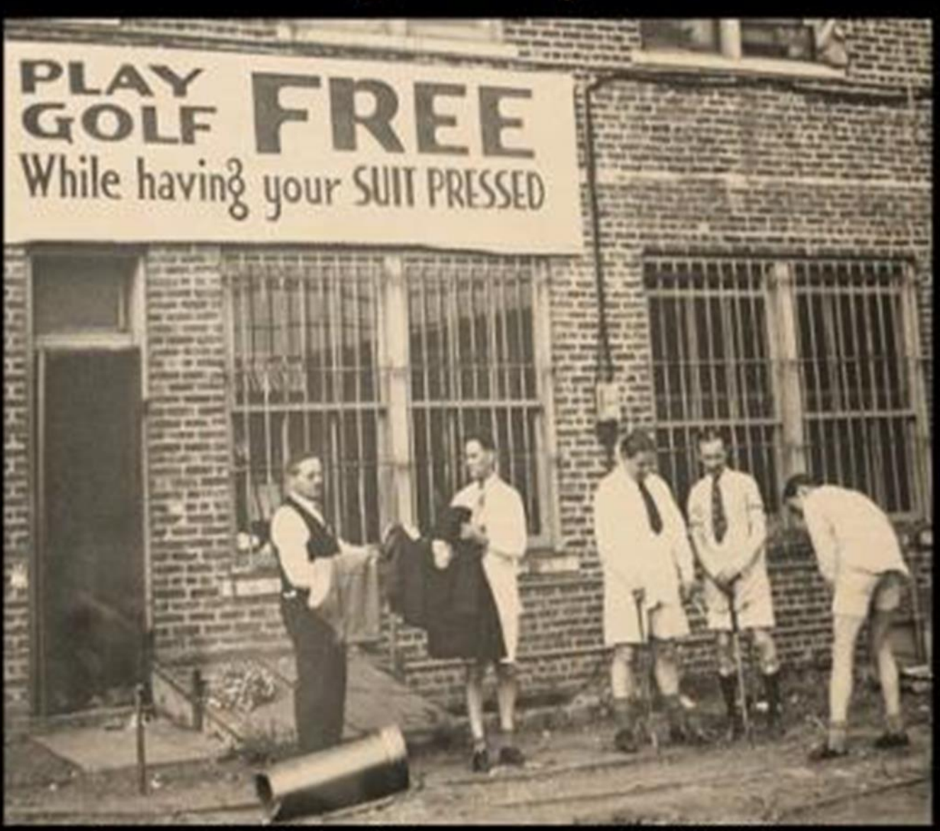
Free round of golf (1 player, 9 holes, no cart, no sun) with $1,000 Suit Pressing