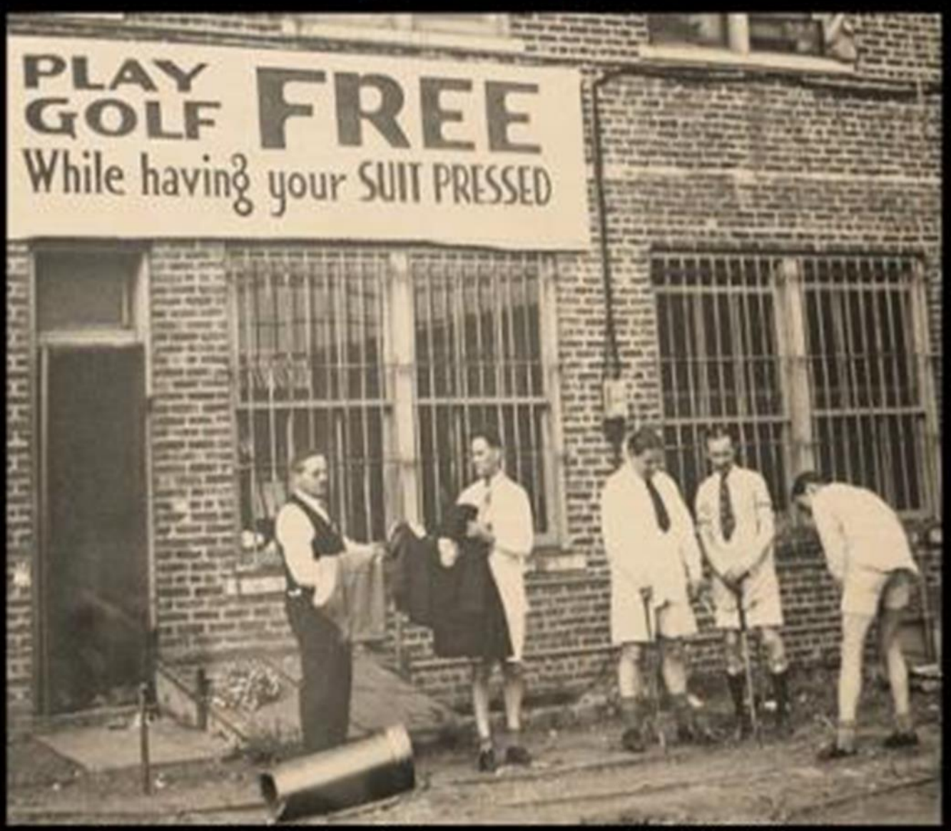
Free round of golf (1 player, 9 holes, no cart, no sun) with $1,000 Suit Pressing